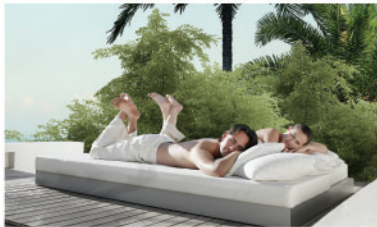
URBAN RESORT LIVING