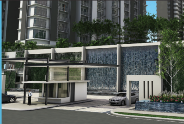
Greenery Landscaped Entrance Statement