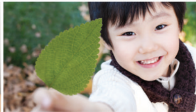
4 ACRES OF GREEN DECK