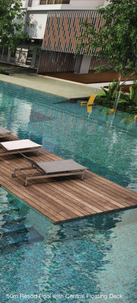
50m Resort Pool with Central Floating Deck