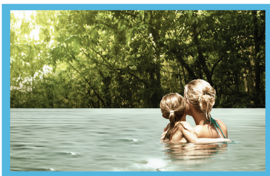
Soak in a pool of harmony

Vina Condominiums comprise of 3 high-rise residential towers sited on a 7.5-acre freehold land in Cheras, varied in 12-storeys, 17-storeys and 26-storeys. Vina is a lifestyle residential development offering spacious condominiums, high-end comprehensive recreational facilities, and first-class security, with over 60% of the development reserved for greenery.