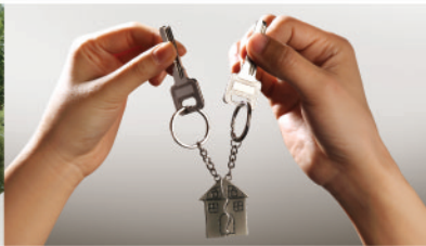
DUAL KEY CONCEPT