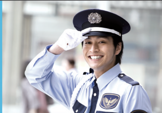
24 hours Security System