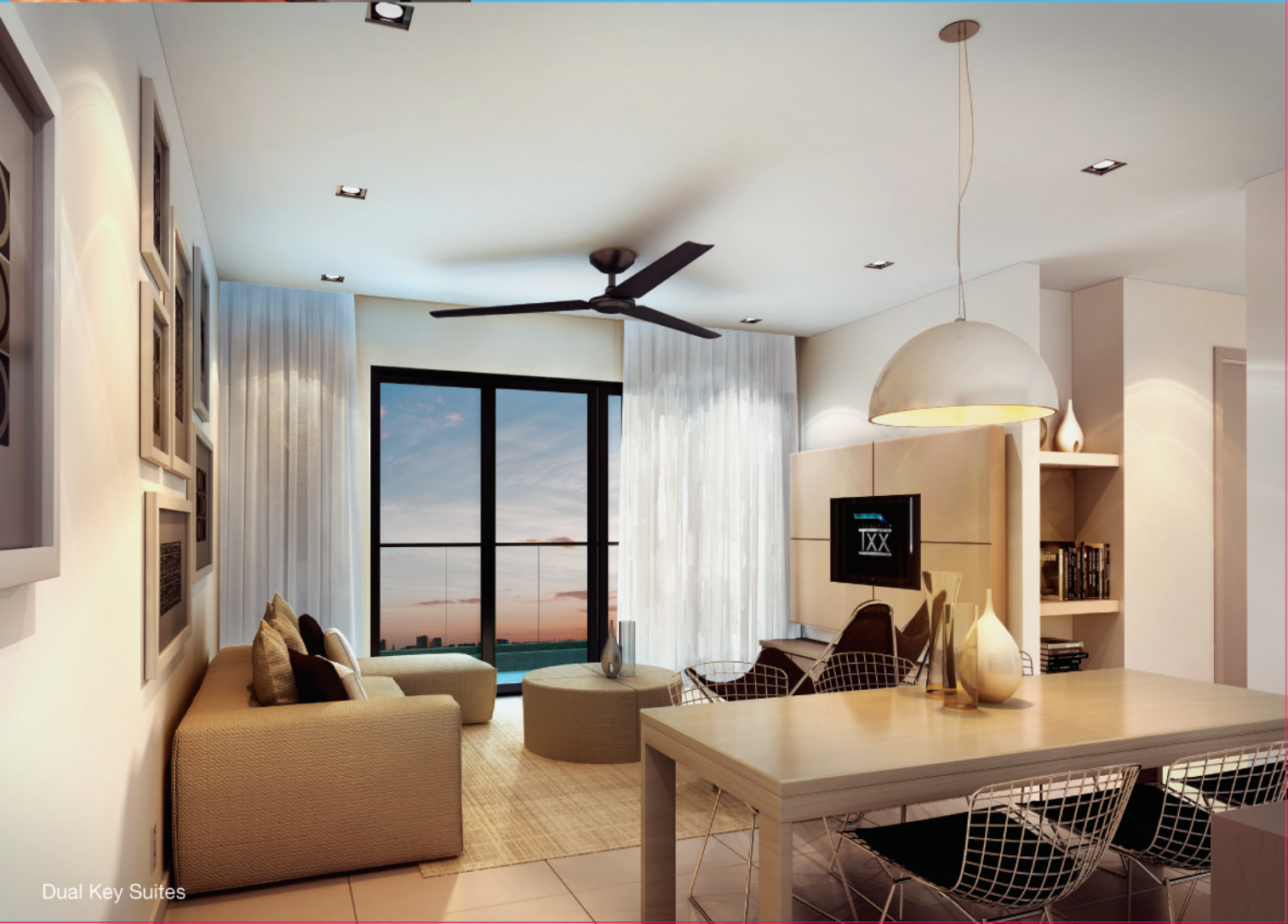
Dual Key Suites